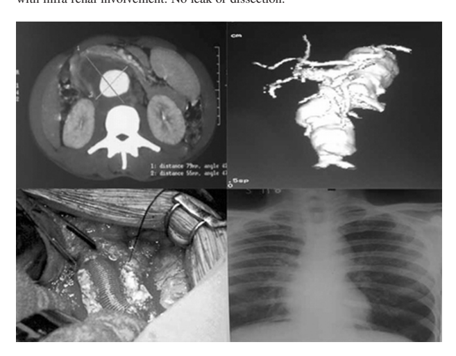
Surgical exploration revealed aneurysm with areas of impending rupture, clots & caseous material. Endoaneurysmal graft repair surgery was done. Clot was teem-

39 year old male was started on antituberculous treatment based on symptoms and miliary shadows on chest x-ray. 2 months later he had persistent abdominal pain. Abdominal examination revealed a pulsatile palpable mass with brui. Ultrasound &CT abdomen confirmed aneurysmal dilatation of aorta from hiatus to bifurcation with infra renal involvement. No leak or dissection.